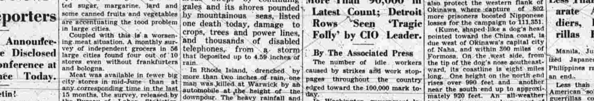
Truman Congratulates Stettinius