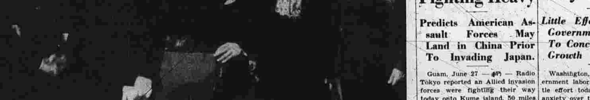
Truman Congratulates Stettinius

President Truman (left) shakes hands with Secretary of State Stettinius after he had signed the United Nations Security Charter in San Francisco, June 25. Looking on are State department officials and some of the American delegation to the conference: Harold Stassen, U. S. Senator, and Dean Virginia Gildersleeve, delegate, and Rep. Charles E. Eaton, delegate. Men in background are not identified.