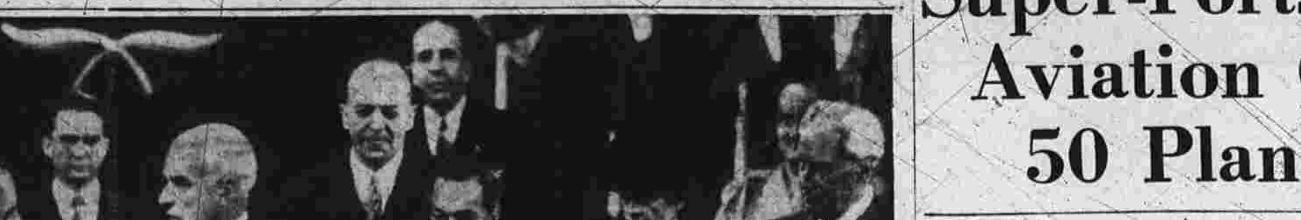
Truman Congratulates Stettinius

President Truman (left) shakes hands with Secretary of State Stettinius after he had signed the United Nations Security Charter in San Francisco, June 25. Looking on are State department officials and some of the American delegation to the conference: Harold Stassen, U. S. Senator, and Dean Virginia Gildersleeve, delegate, and Rep. Charles E. Eaton, delegate. Men in background are not identified.